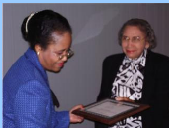
Poet Naomi Long Madgett receives award at Essence of Motown Awards Ceremony

We welcome you to join us in our growth and assist us in our mission. Your partnership will directly align you with our objective of creating an active and energized membership. As writers, we are skilled at bringing your message to the public!