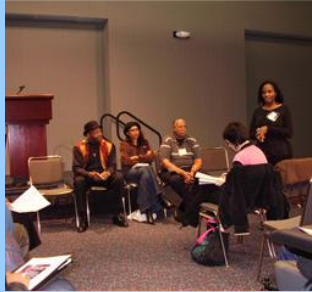
Attendees participate in a workshop